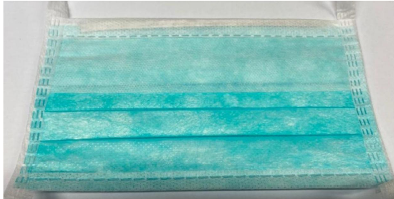
Figure 1: "Einwegmaske / OP-Maske" mask sample as received